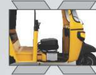
Comfortable Driver Cabin