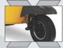
Extra Strong Steering Column & Chassis