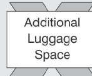
Additional Luggage Space