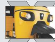
Contemporary Front Look