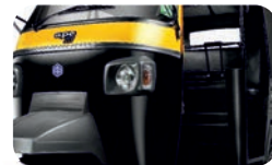
Extended Paint Life