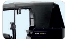
Extra Sturdy & Stylish Body