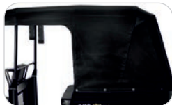
Extra Strong Hood