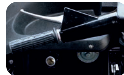
Longer Clutch Life