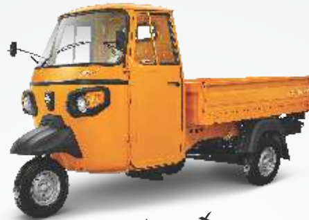
Ape Xtra LDX