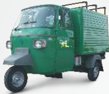
apé HIGH BODY