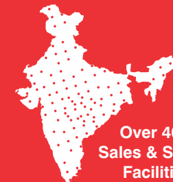
Over 4000 Sales & Service Facilities*