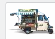
Vegetable / Grocery Shop