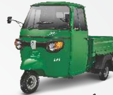
Ape City XTRA