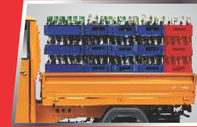
XTRA LONG DECK