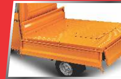
XTRA STRONG PLATFORM