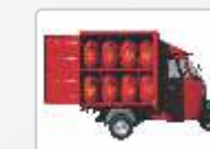
Biomedical Waste Van