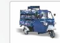
Soft Drink Carrier