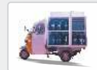
Mineral Water Van